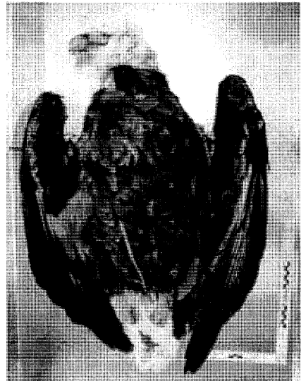
Exhibit Photo— Adult bald eagle killed after ingesting Carbofuran-poisoned coyote carcass